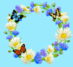
MAKING A WREATH