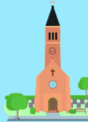
GOING TO CHURCH