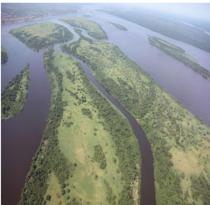
Aerial view of the Congo River

Prior to this period, huge tracts of land had been mapped by well-known explorers such as David Livingstone, Henry Morgan Stanley, Richard Burton and John Speke. Thanks to these expeditions, though often controversial for their ill-treatment of natives, the sources of the Nile, Zambezi, Niger and Congo rivers had been found and traced; vast amounts of resources discovered while technological and medical progress made it easier for Europeans to travel, settle and expand in the said areas.