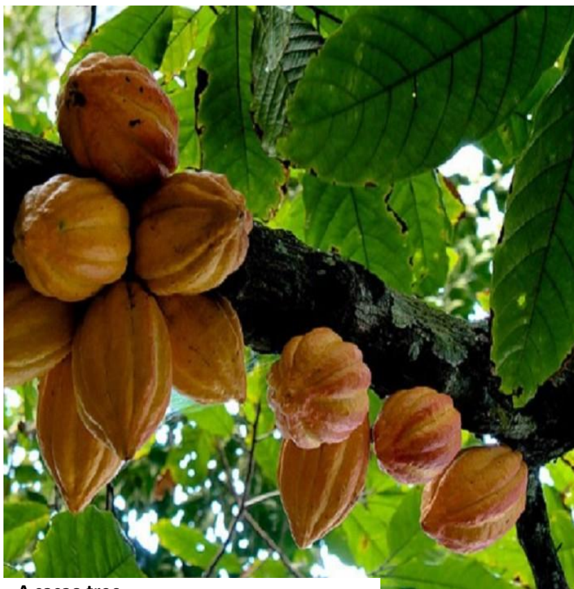
A cacao tree

The cake was big and the cherries on it even bigger. In Africa, Europeans found raw materials that could not be readily found in their homelands such as diamonds, gold, cacao, ivory, rubber, groundnuts, tea, palm oil and copper. They also found cheap labour in the form of native people that could work on the plantations of valuable cash crops throughout the year without having to share the benefits. Possessions in Africa was also a source of pride for the powerful European countries and the more colonies one country had, the higher status it acquired